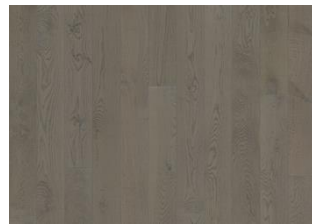
OAK CARBON MATTE