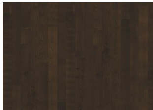
OAK CURIO MATTE