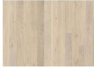
OAK CADENCE MATTE