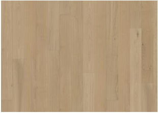
OAK FAWN MATTE