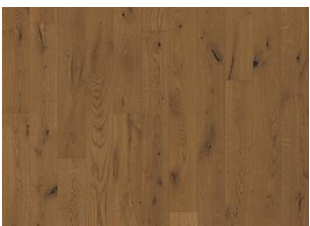
OAK TUFT MATTE