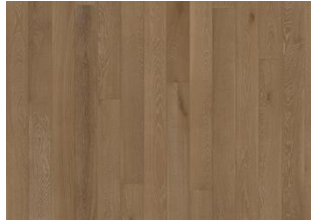
OAK HENNA MATTE