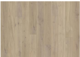
OAK MUSE MATTE