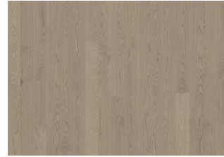
OAK REITER MATTE